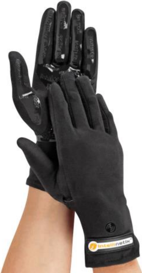
Figure 1 The vibrating gloves